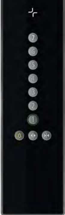
Card reader integrated with KSC D23 car operating panel