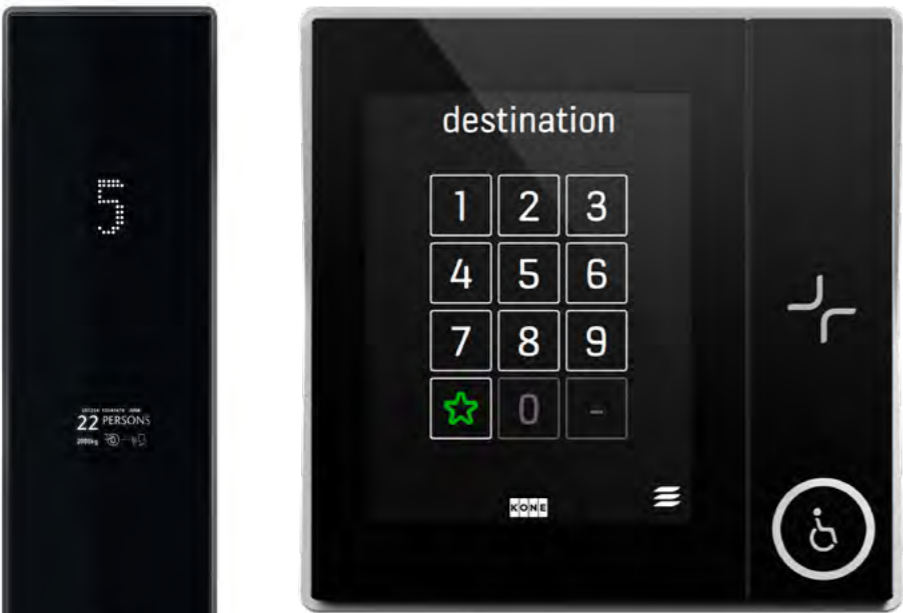
Card reader integrated with KSP 858 touchscreen destination operating panel

Our user-friendly, integrated access and destination solutions are designed to make it easy for people to move throughout your building.