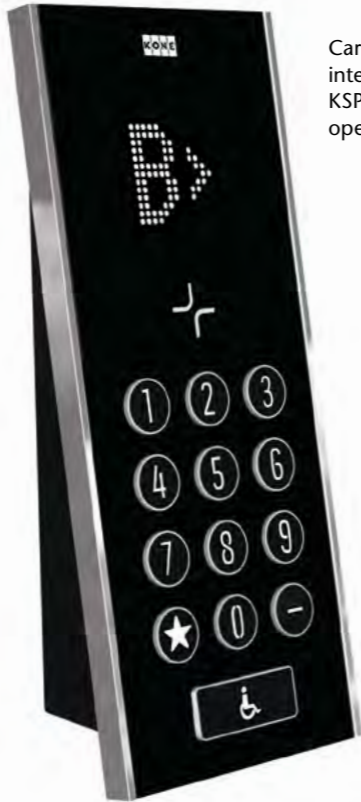
Card reader integrated with KSP 853 destination operating panel