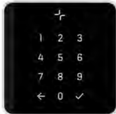
Card reader with PIN